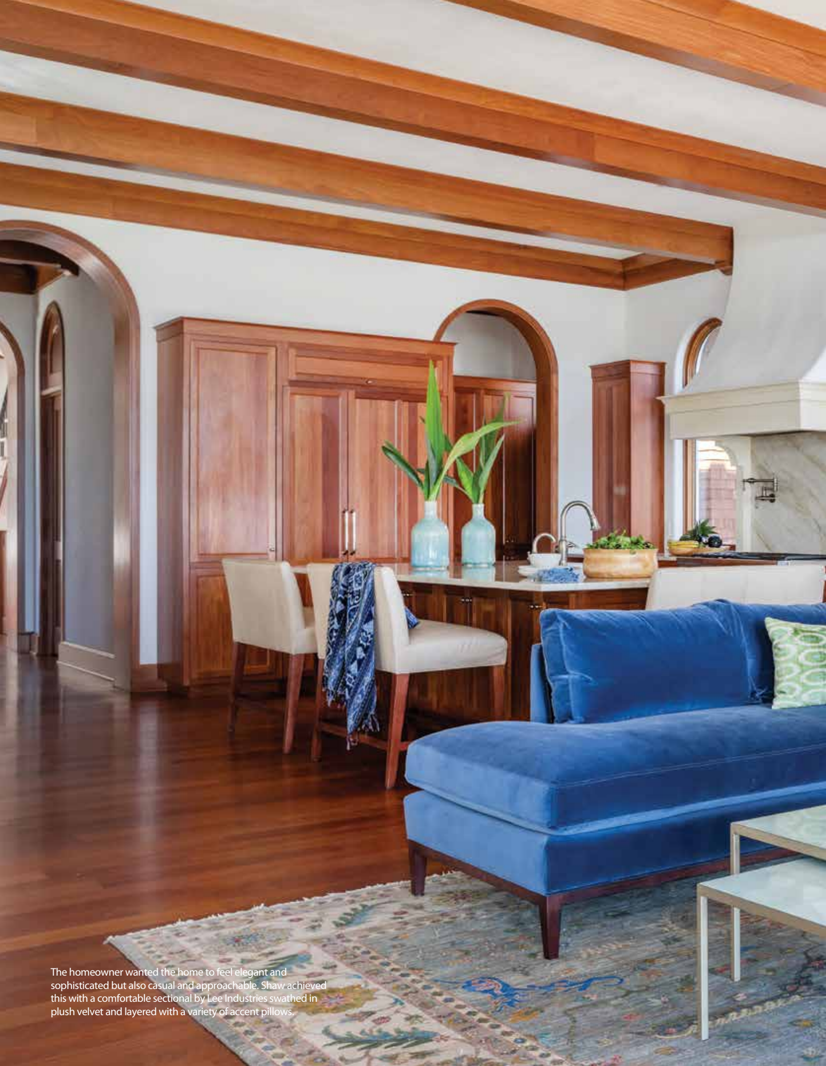
The homeowner wanted the home to feel elegant and sophisticated but also casual and approachable. Shaw achieved this with a comfortable sectional by Lee Industries swathed in plush velvet and layered with a variety of accent pillows.