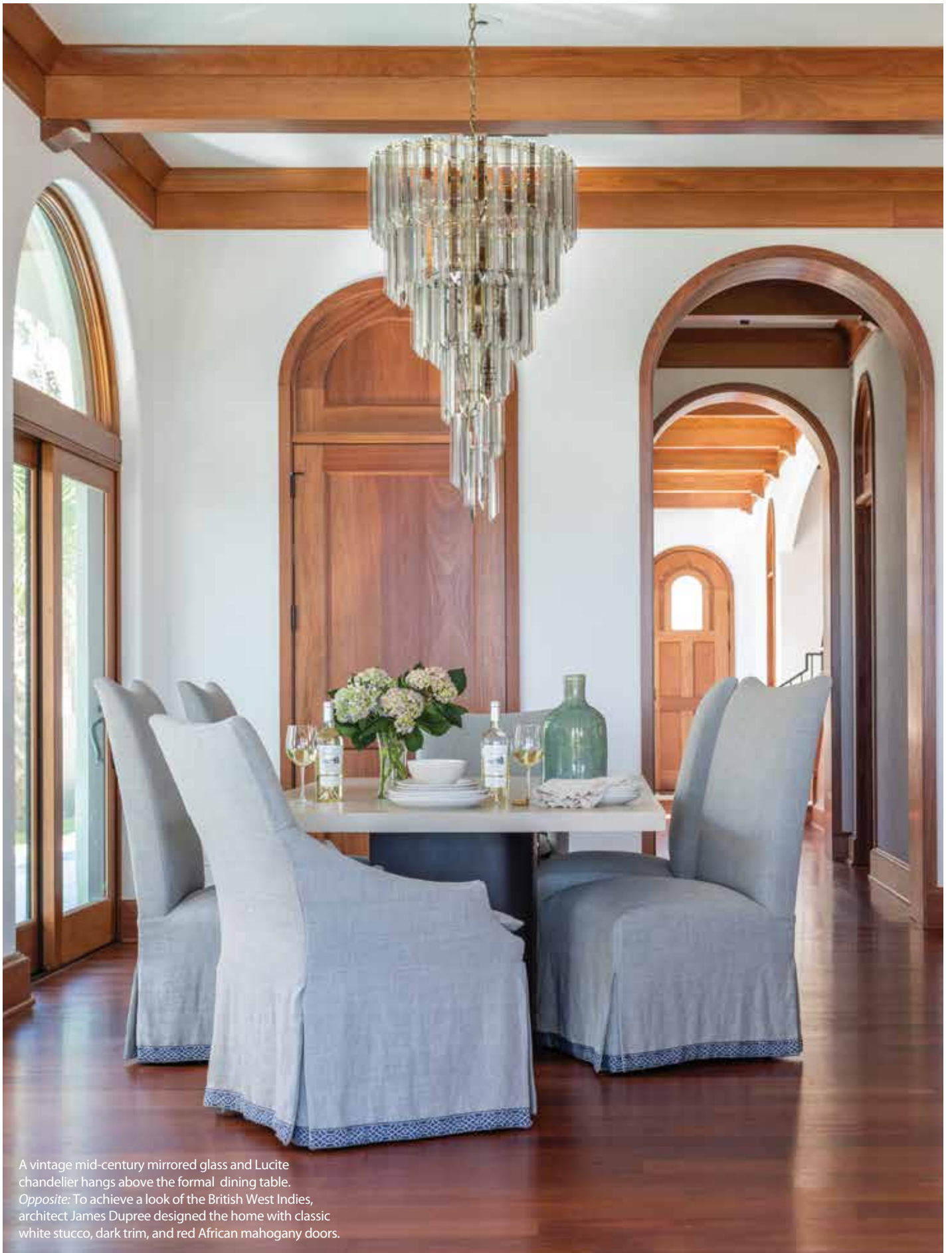
A vintage mid-century mirrored glass and Lucite chandelier hangs above the formal dining table. Opposite: To achieve a look of the British West Indies, architect James Dupree designed the home with classic white stucco, dark trim, and red African mahogany doors.